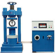
Fig. 2: Compression Testing Machine

The testing machine may be of any reliable type, of sufficient capacity for the tests and capable of applying the load at the specified rate. The permissible error shall be not greater than \pm 2 percent of the maximum load.