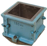
Fig. 3: Moulds/ Cubes for Testing

The mould shall be of 150 mm size conforming to IS: 10086-1982.