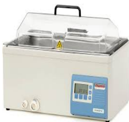
Fig. 3: Water bath

between two glass plates. The temperature of the moulding room, dry materials and water shall be maintained at 27 \pm 2^\circ\text{C} The relative humidity of the laboratory shall be 65 \pm 5 percent. The moist closet or moist room shall be maintained at 27 \pm 2^\circ\text{C} and at a relative humidity of not less than 90 percent.