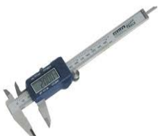
Fig. 4: Vernier Calliper

Water bath capable of containing immersed Le-Chatelier moulds with specimens and of raising their temperature from 27 \pm 2^\circ\text{C} to boiling in 27 \pm 3 minutes.