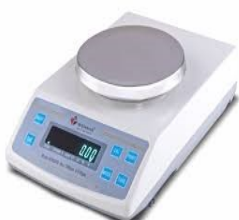
Fig. 5: Balance

Vernier Calliper should be able to measure upto 30 mm with least count of 0.1 mm