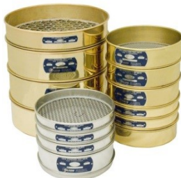
Fig. 3: Sieve

Balance: one of capacity 10 kg and least count 1g and other of 200 g capacity and sensitivity 0.01 g