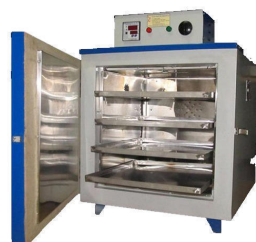
Fig. 4: Oven

4.75mm, 19 mm and 37.5 mm I.S. Sieves conforming to IS: 460 (Part 1) – 1985