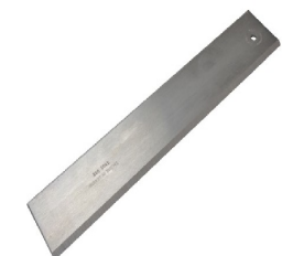
Fig. 5: Steel Straight Edge

Thermostatically controlled to maintain temperature between 105^{\circ} to 110^{\circ}\text{C}