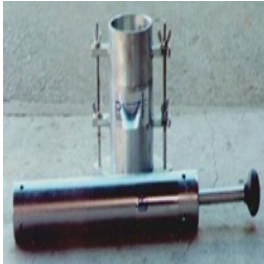
Fig. 1: Proctor Mould & Metal Rammer

Metal mould (volume = 1000 \text{ cm}^3 for 100 mm diameter mould and volume = 2250 \text{ cm}^3 for 150 mm diameter mould (as per IS:10074-1982) & Metal rammer conforming to IS: 9189-1979. (weight = 4.9 kg)