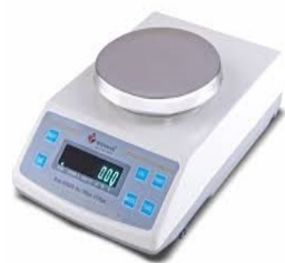
Fig. 2: Balance

Metal mould (volume = 1000 \text{ cm}^3 for 100 mm diameter mould and volume = 2250 \text{ cm}^3 for 150 mm diameter mould (as per IS:10074-1982) & Metal rammer conforming to IS: 9189-1979. (weight = 4.9 kg)