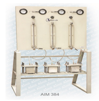
Table 1 : Typical Details of Permeability Cell