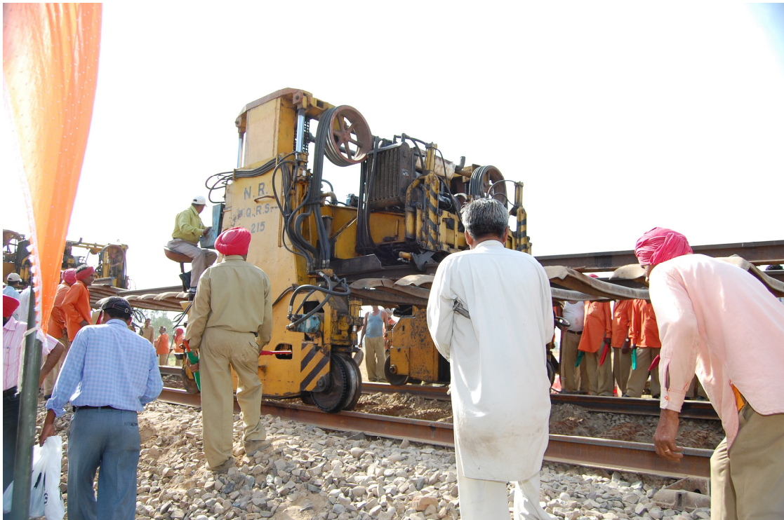
Fig 2: Relaying of track by PQR S

Other projects (e.g. Abohar-Fazilka new BG line) have used Mobile Flash Welding Machines to make long/continuous welded rails in new sections.