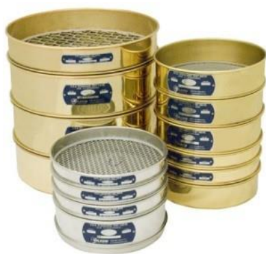
Fig. 4: Sieve

Balance be capable of weighing up to 10 g to the nearest 10 mg.