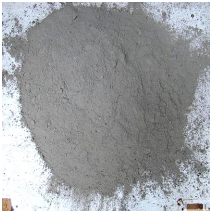
Fig. 2: Cement

The samples of the cement shall be taken according to the requirements of IS 3535:1986 and the relevant standard specification for the type of cement being tested. The representative sample of the cement selected as above shall be thoroughly mixed before testing.