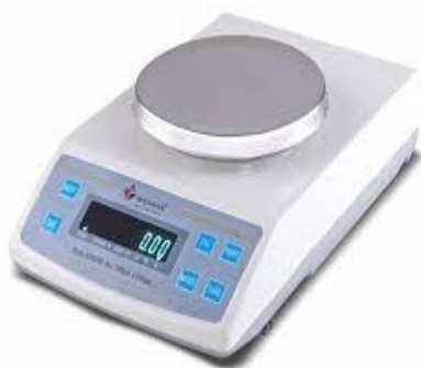
Fig. 3: Balance

The samples of the cement shall be taken according to the requirements of IS 3535:1986 and the relevant standard specification for the type of cement being tested. The representative sample of the cement selected as above shall be thoroughly mixed before testing.