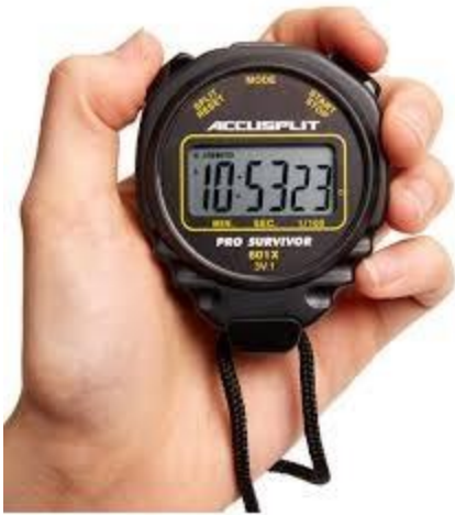
Fig. 3: Stop Watch