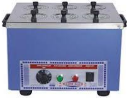
Fig. 3: Evaporating Dish