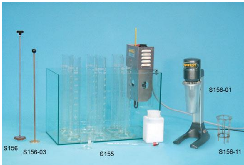
Fig. 1: Hydrometer

Calibrated at 27°C, range of 0.995 to 1.030 g/cc