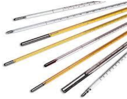
Fig. 4: Thermometer

3. Reference: IS-2720 (Part 4):1985 (Reaffirmed- May 2015) "Methods of test for soils: Grain size analysis".